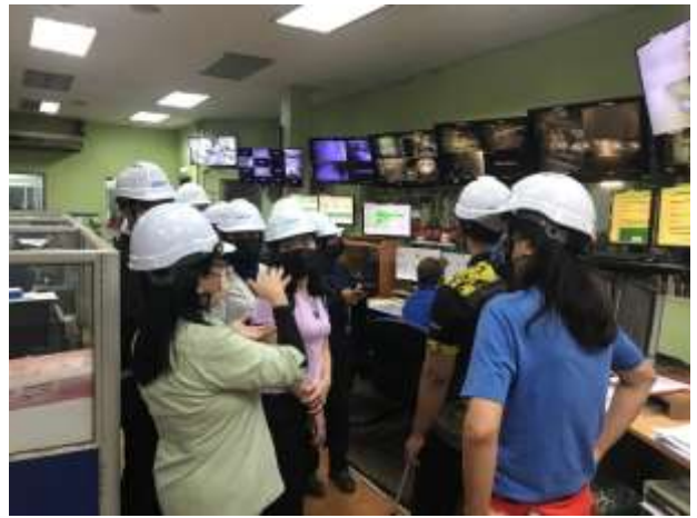
Figure 6 Control Room