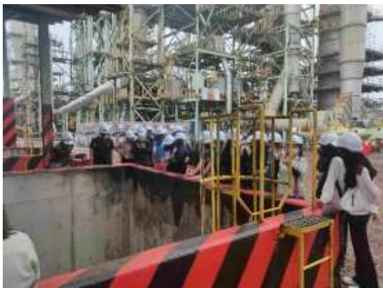
Figure 3 Chip Bin