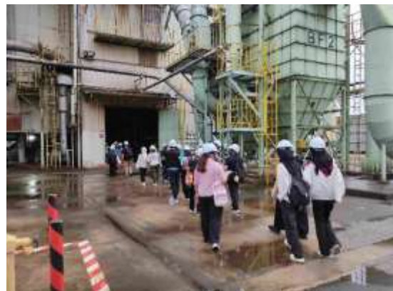
Figure 4 Move to the Forming Line