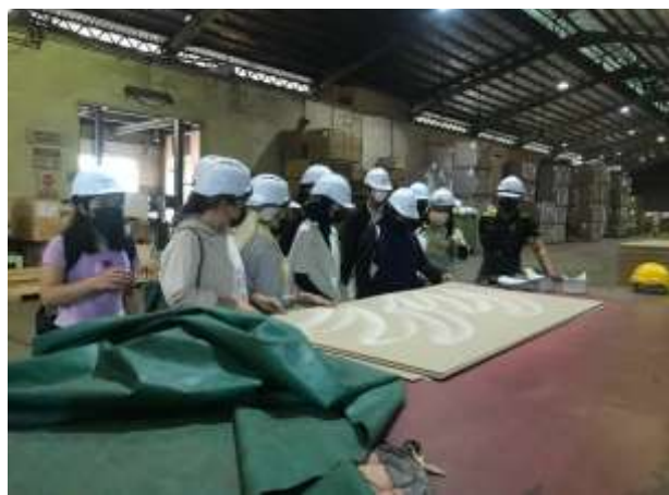
Figure 9 Packing Area