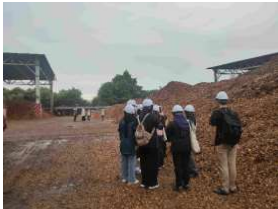
Figure 2 Chip Yard