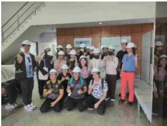
Figure 1 Group Photo before the Plant Tour