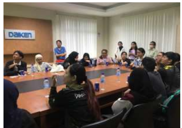
Figure 10 Q&A Session