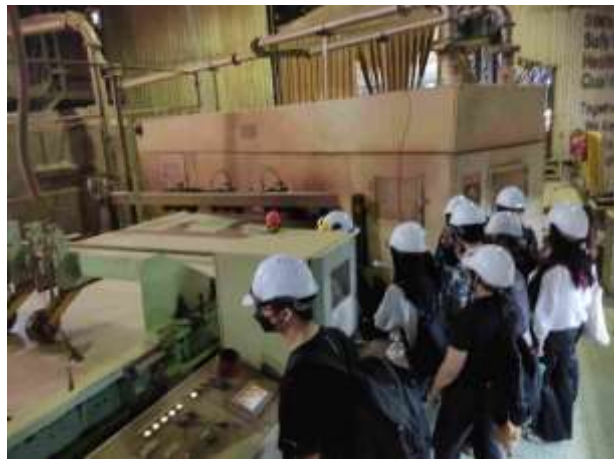
Figure 7 CPS