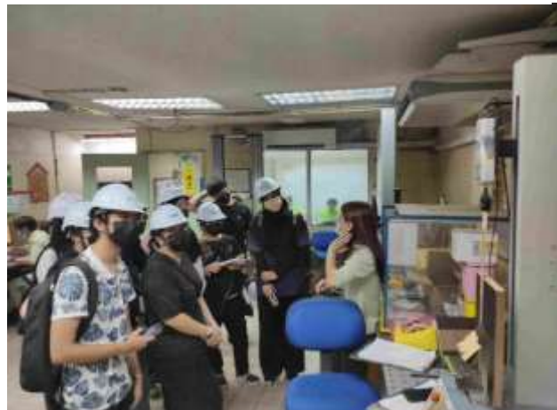
Figure 8 Laboratory